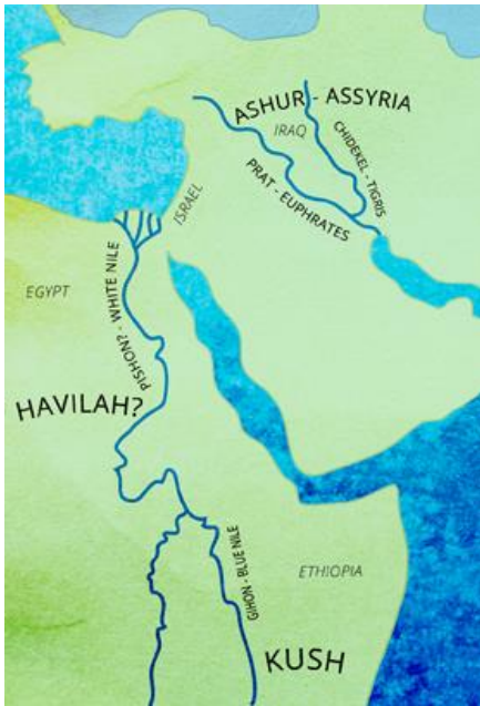
The Four Rivers

that flowed from Eden to the Garden, which watered all the plants and trees in the Garden. After this river passed through the Garden, it submerged underground and resurfaced as four different rivers. 8